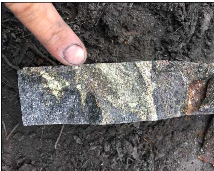
Photo 4: Munischiwan Property, gabbro-hosted disseminated to semi-massive chalcopyrite, 2.53% Cu, 9.0 g/t Ag (grab sample Y104993)